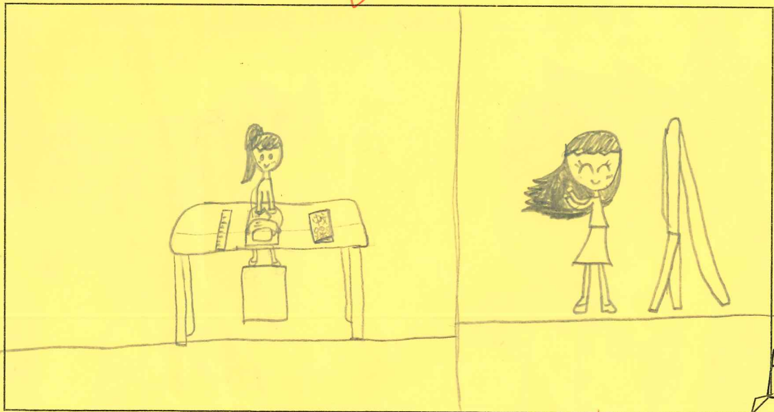
I could pack my school bag and comb my hair when I was seven years old.